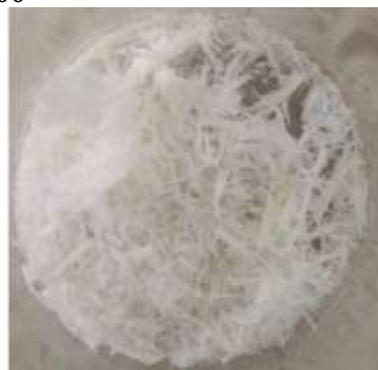
Figure 1: (a) Green pea peels sample before treatment (b) Extracted Cellulose.

The FTIR spectrum of the extracted cellulose was compared with commercial Cellulose and the IR spectrum of both samples was found to be the same (Figure 2).